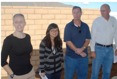
4 ARRA Employees hired permanently by Habitat for Humanity Riverside