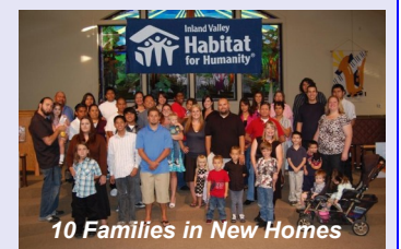
10 Families in New Homes